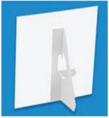
8"w x 11"h Vertical Sign with Easel

The addition of graphics to your booth will catch the eye of visitors, drawing them out of the aisle and in to your space.