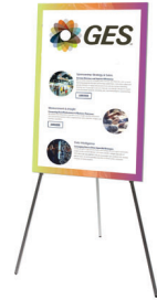
28"w x 44"h Vertical Sign