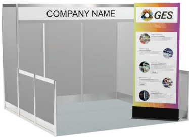
38"w x 96"h Vertical Sign with Stand